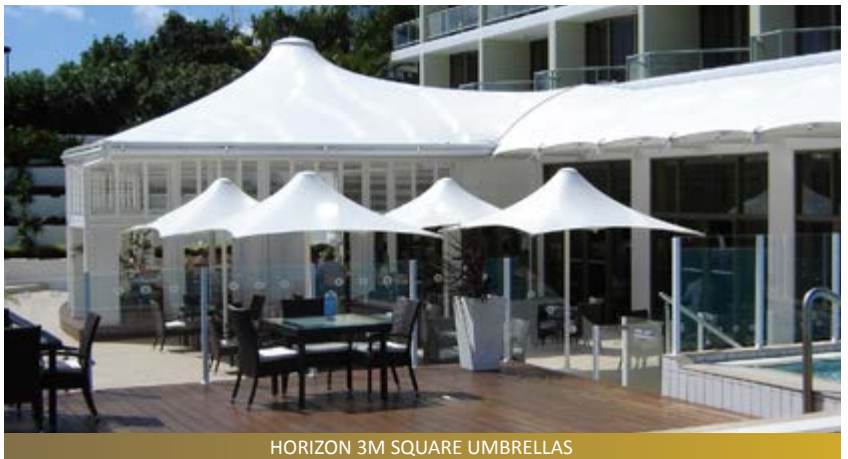
HORIZON 3M SQUARE UMBRELLAS