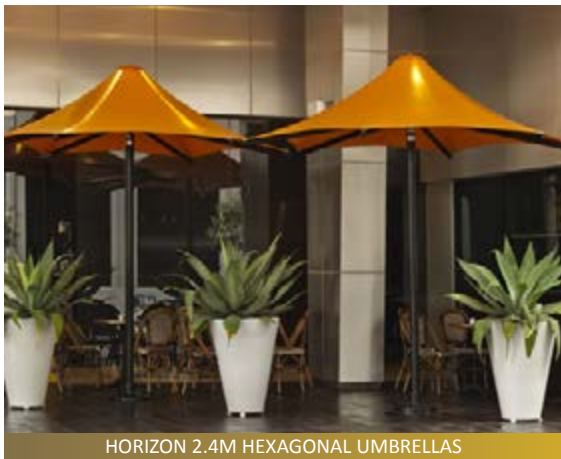
HORIZON 2.4M HEXAGONAL UMBRELLAS