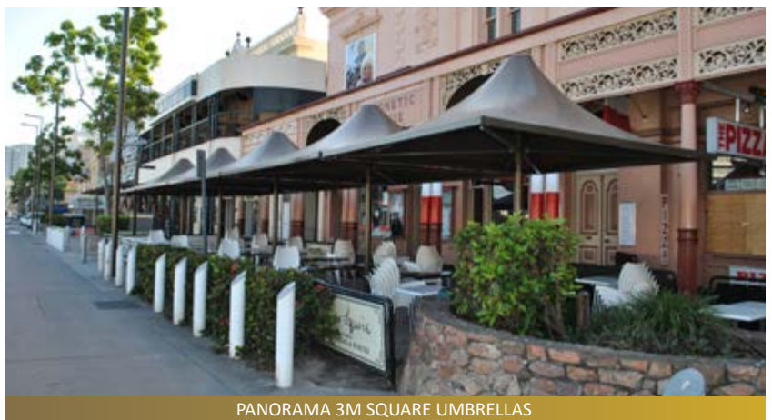
PANORAMA 3M SQUARE UMBRELLAS