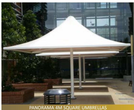
PANORAMA 4M SQUARE UMBRELLAS