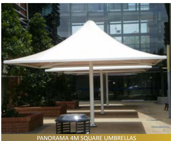
PANORAMA 4M SQUARE UMBRELLAS