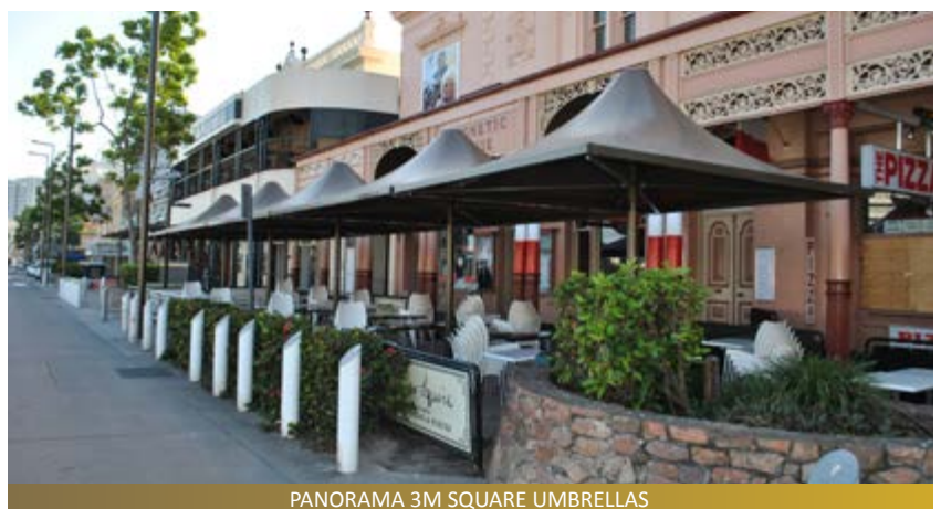
PANORAMA 3M SQUARE UMBRELLAS