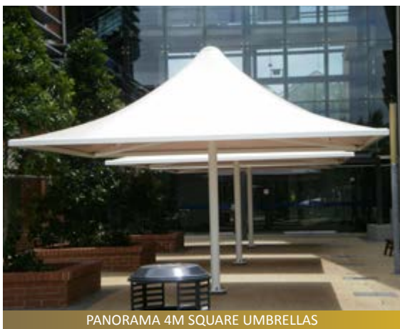
PANORAMA 4M SQUARE UMBRELLAS