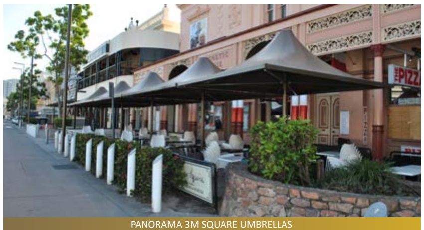
PANORAMA 3M SQUARE UMBRELLAS