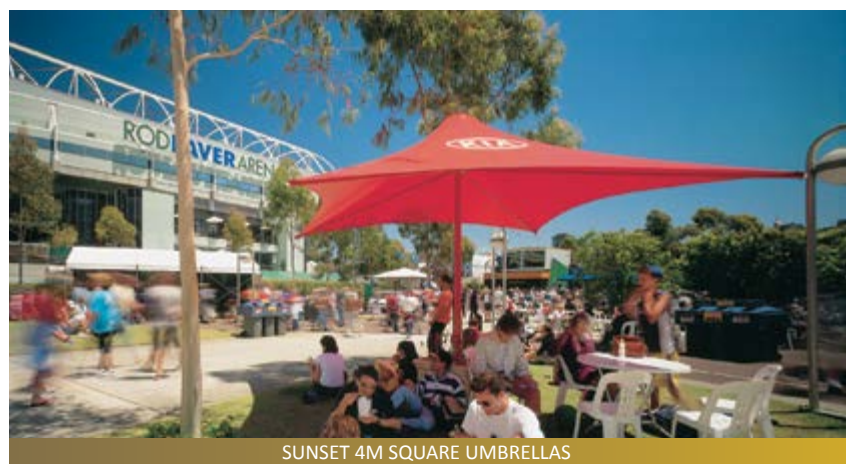
SUNSET 4M SQUARE UMBRELLAS