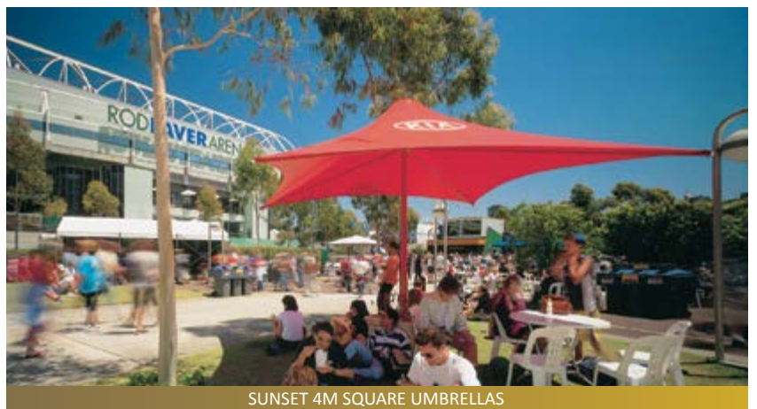
SUNSET 4M SQUARE UMBRELLAS