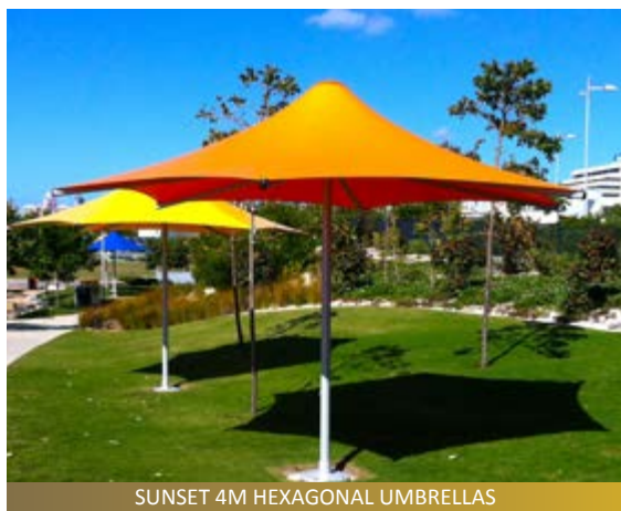
SUNSET 4M HEXAGONAL UMBRELLAS