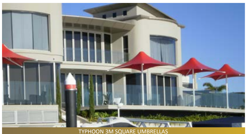
TYPHOON 3M SQUARE UMBRELLAS