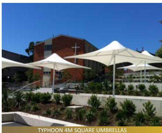
TYPHOON 4M SQUARE UMBRELLAS