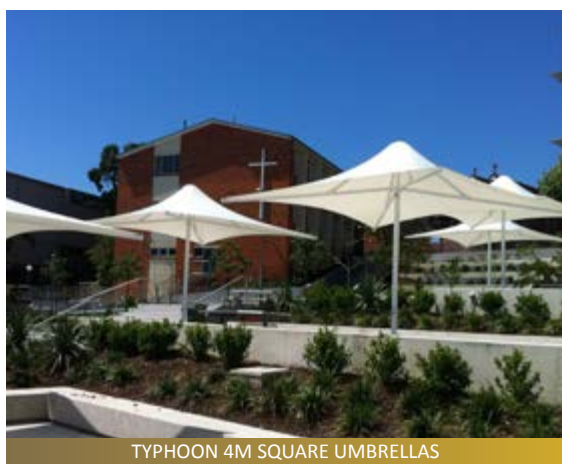
TYPHOON 4M SQUARE UMBRELLAS