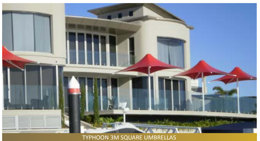
TYPHOON 3M SQUARE UMBRELLAS