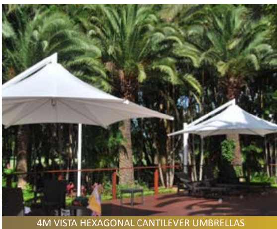
4M VISTA HEXAGONAL CANTILEVER UMBRELLAS