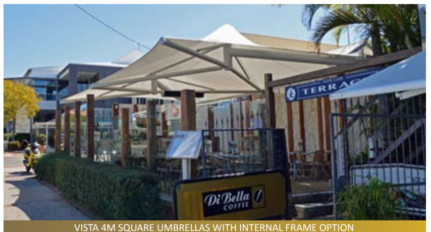
VISTA 4M SQUARE UMBRELLAS WITH INTERNAL FRAME OPTION