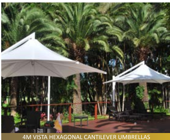
4M VISTA HEXAGONAL CANTILEVER UMBRELLAS