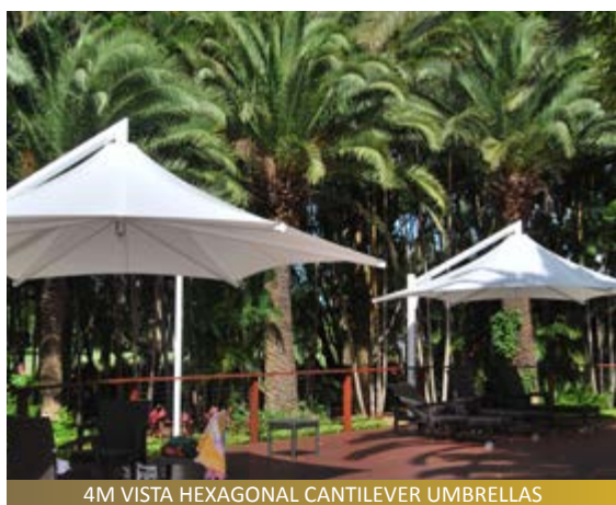
4M VISTA HEXAGONAL CANTILEVER UMBRELLAS