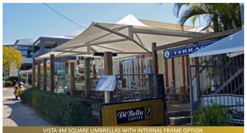
VISTA 4M SQUARE UMBRELLAS WITH INTERNAL FRAME OPTION