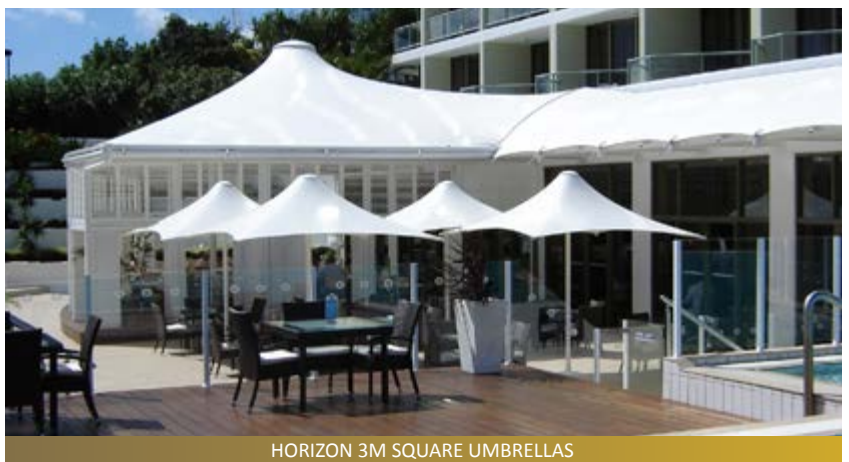
HORIZON 3M SQUARE UMBRELLAS