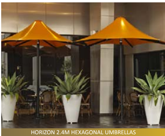
HORIZON 2.4M HEXAGONAL UMBRELLAS