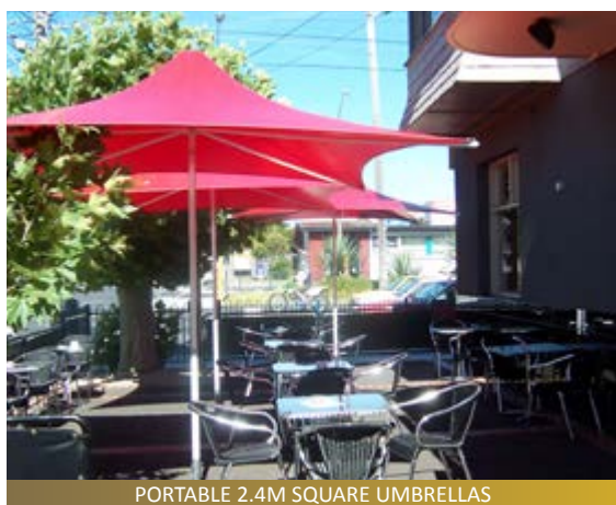
PORTABLE 2.4M SQUARE UMBRELLAS