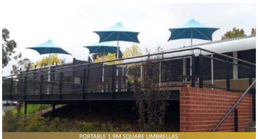
PORTABLE 1.9M SQUARE UMBRELLAS