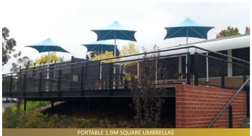
PORTABLE 1.9M SQUARE UMBRELLAS