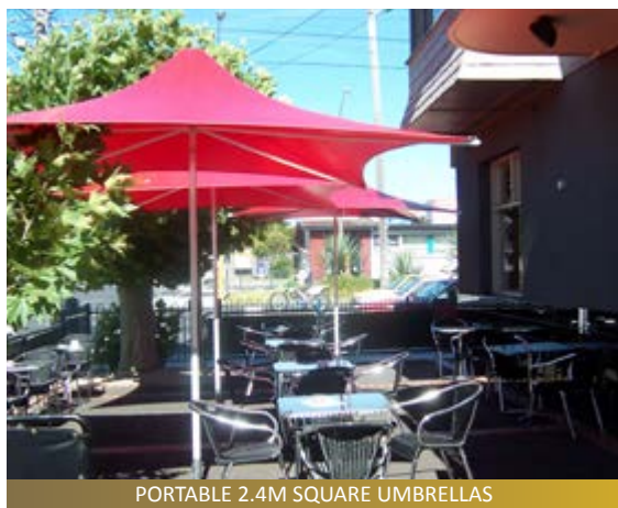
PORTABLE 2.4M SQUARE UMBRELLAS