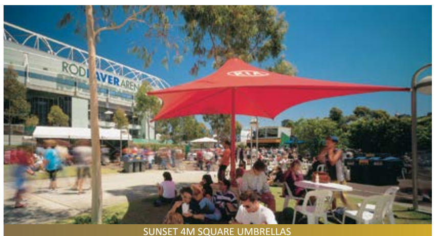
SUNSET 4M SQUARE UMBRELLAS