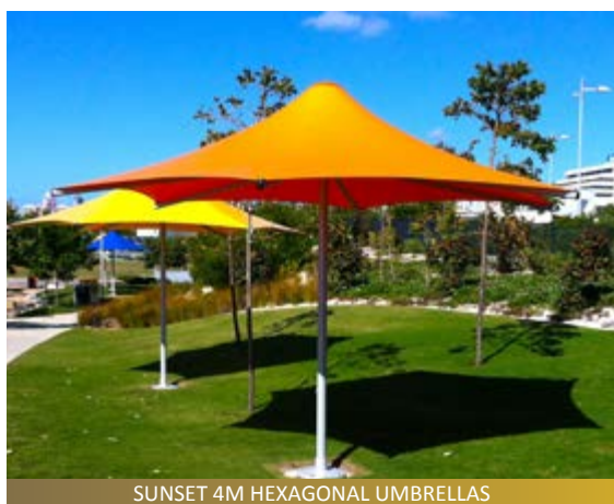
SUNSET 4M HEXAGONAL UMBRELLAS