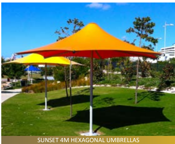
SUNSET 4M HEXAGONAL UMBRELLAS